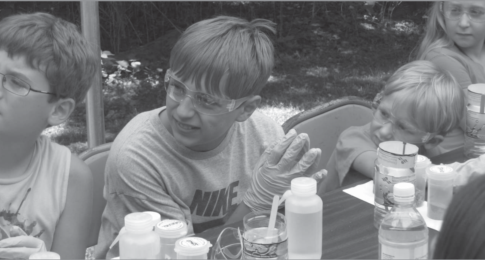
Junior Chemists build an individual water filtration device during a Wonderful World of Water Day Camp at the Greentree Nature Center.

Water, water, everywhere! PRC's Watershed Awareness Program is overflowing! Since its inception as an in-school program in 2003, it has expanded to include the Celebrate the Rain! Watershed Awareness/Rain Barrel Workshop for the adult community, Act 48 teacher workshops, pre-service teacher workshops and The Wonderful World of Water Day Camp – a free children's summer camp sponsored by the Pennsylvania American Water Company.