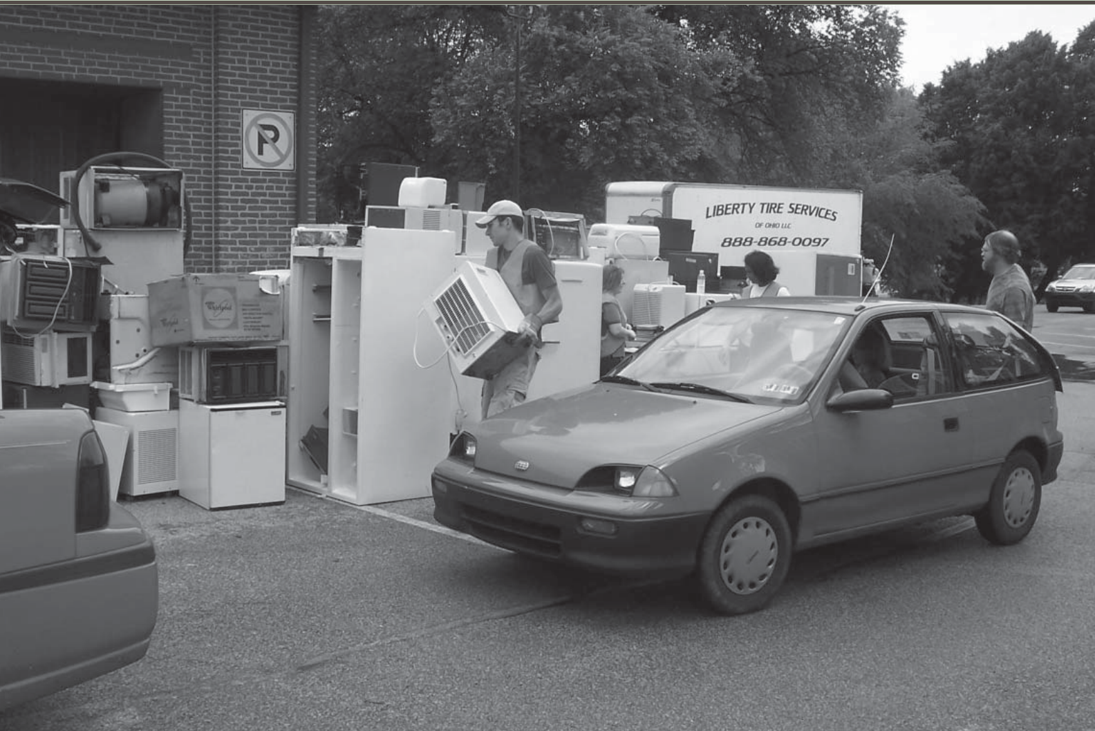
A volunteer unloads a window air conditioner at a “Hard to Recycle” collection at the Allegheny County Health Department parking lot.

Through the Solid Waste Association of North America (SWANA) Technical Assistance Program, PRC completed projects for West Homestead Borough in Allegheny County and Indiana Borough in Indiana County. The studies chronicled the myriad of issues surrounding establishing a recycling drop-off program in each of the municipalities. PRC's comprehensive reports included not only findings and recommendations, but also useful resources to assist municipal managers make informed decisions.