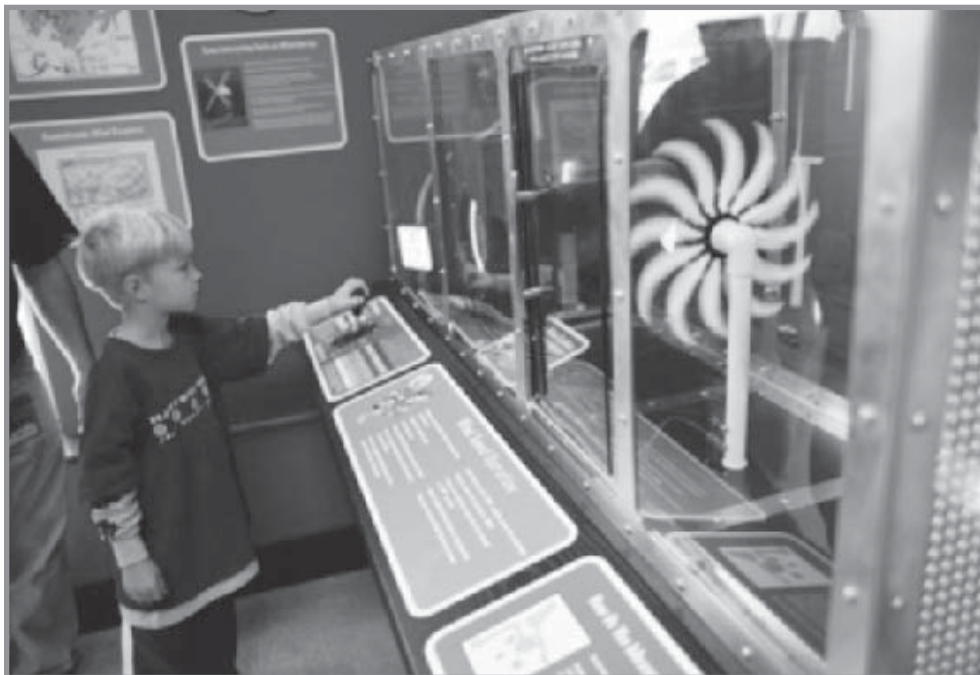
A student uses one of the many hands-on exhibits at Exelon Corporation's Renewable Energy Education Center in Fairless Hills, PA.

Teachers have enjoyed the fact that the program is very hands-on, and engaging, and students seemed to love the experimental nature of many of the activities. The project is a great fit for PRC as well, helping to fulfill one of the goals of our new 3-year Strategic Plan – to expand education and outreach programs to include alternative energy and energy conservation.