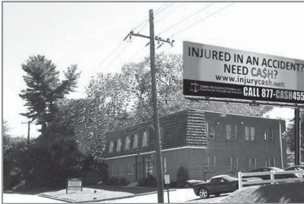
Conceptual view of proposed billboard site on Sproul Road in Delaware County.

PRC is leading the effort to educate citizens and government officials on the threat to our communities posed by outdoor advertising. Working under contract with the Delaware Valley Regional Planning Commission, PRC provides consulting services to municipalities on the issues of illegal billboard removal, stronger local ordinances to control outdoor