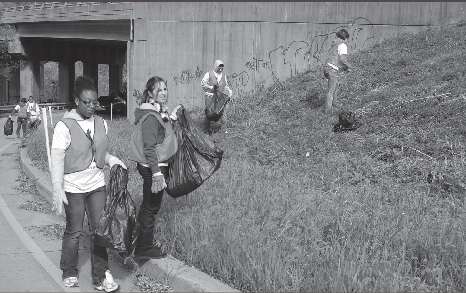
Volunteers “Redd-Up” along a difficult highway in Pittsburgh on October 18.

Established in 2005 by PRC and City Council, The Clean Pittsburgh Commission (CPC) is a network of City departments, local non-profits, individuals and community groups working together to improve the environmental quality of life of Pittsburgh residents through litter and illegal dumping prevention, cleanup and enforcement.