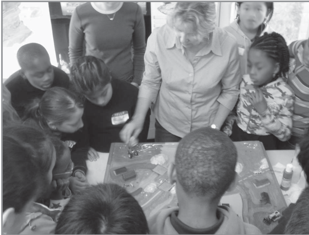
Using an EnviroScape model, students learn how watersheds become polluted.

PRC thanks PADEP and our generous EITC contributors, Waste Management, Wawa, PP& L Corporation, PNC Bank and Aqua PA for making these programs possible.